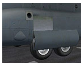
APU Exhaust Heat- Protection