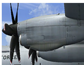
AE2100D3 Engines (4)