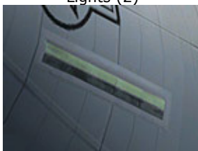
Aft Fuselage Formation Lights (2)