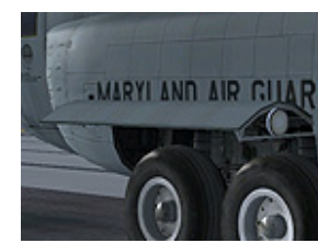
Ground maintenance Doors Position