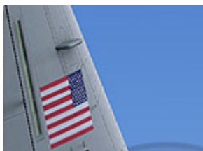
Fin Formation Lights (2)