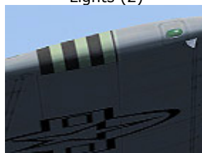
Wing Tips Formation Lights (2)