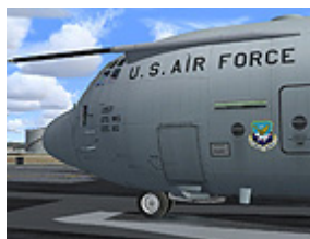
LH side Refueling probe (Exterior view)