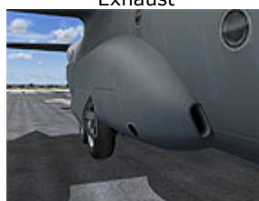
Cargo Compartment Ac Air Inlet Scoop And Exhaust