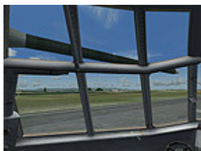
LH side Refueling probe (VC view)