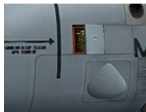
APU Inlet Door And Exhaust