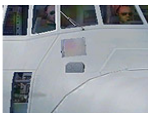
Modified Windows (2)